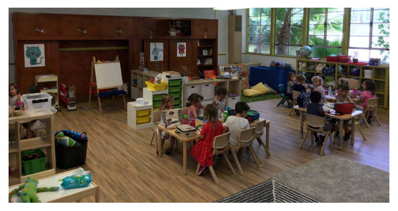
Los Feliz Early Learning Center