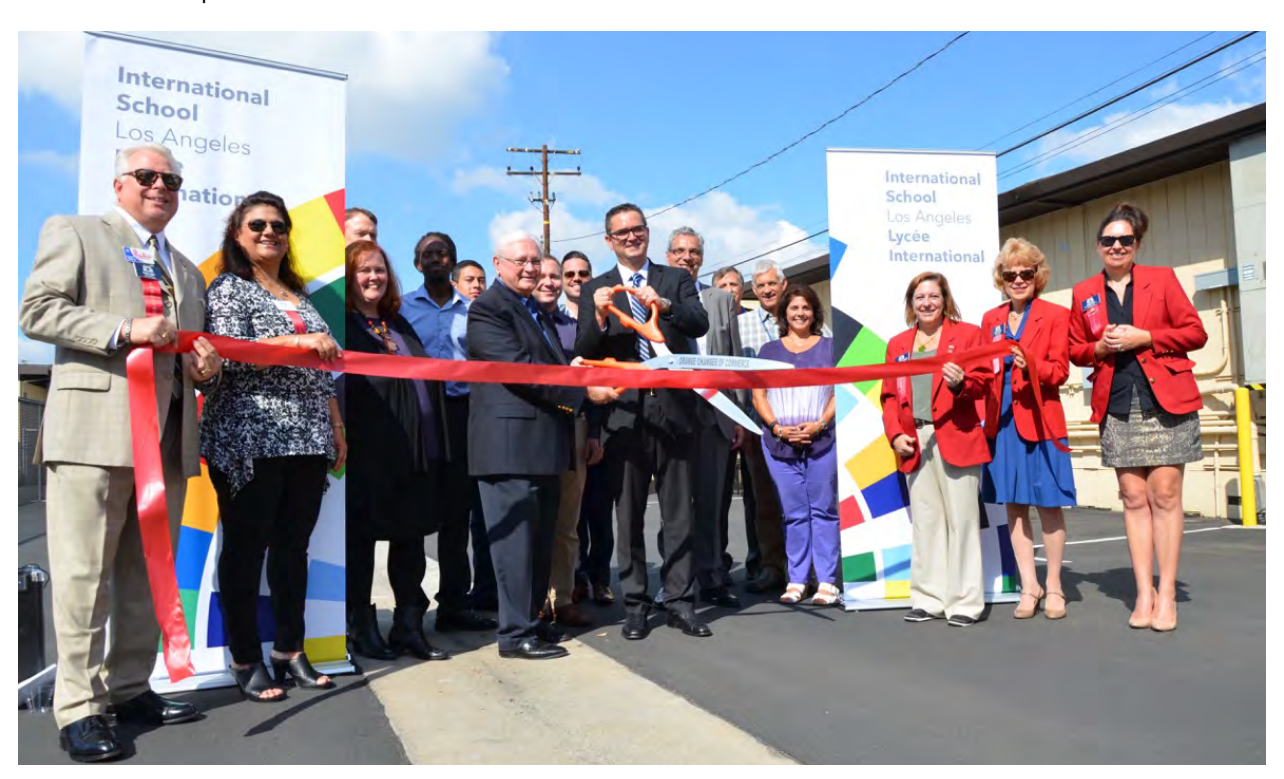
Orange County Campus Ribbon Cutting

2018-2025 Strategic Plan October 2018 LILA Board of Trustees Page 3 of 17